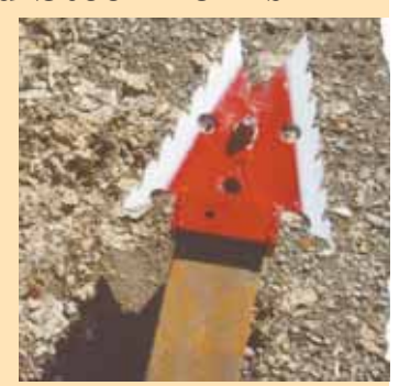
V-shaped steel "cutting teeth" slide onto tips of skid loader forks.

marijuana) are showing increased interest in both chlorophyll and nutrient meters.