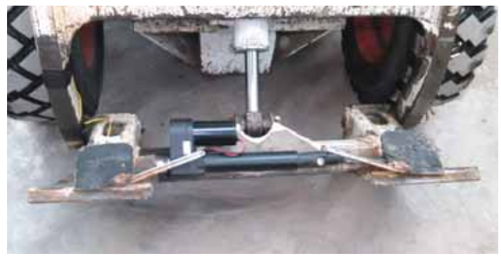
Electric actuator eliminates the need to manually lock and unlock skid loader's quickattach levers.

"It worked as good and fast as a factory-