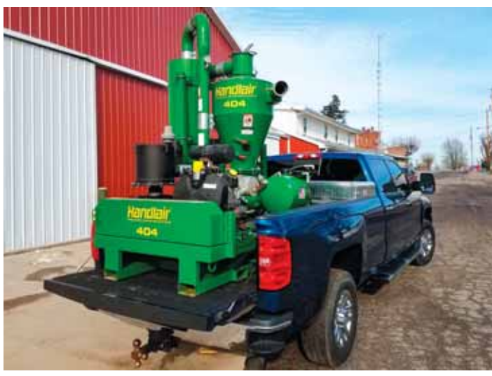
Compact grain vac is small enough to mount in a pickup with a skid loader. It's available in either electric or gas-powered models.

Contact: FARM SHOW Followup, Christianson Systems, P.O. Box 138, Blomkest, Minn. 56216 (ph 320 995-6141; toll free 800 328-8896; sales@christianson. com; www.christianson.com)