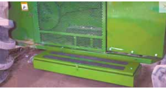
Step-on toolbox has a pair of built-in support arms that bolt on in place of combine's original

Contact: FARM SHOW Followup, Sloan Express, 120 N. Business 51, Assumption, Ill. 62510 (ph 800 934-9777; nbrazel@sloans. com; www.sloanex.com).