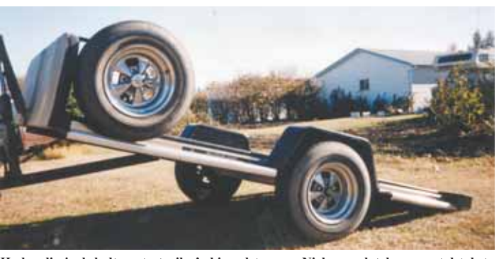
Hydraulic jack bolts onto trailer's hinged tongue. Nielsen unlatches a metal tab to release front end of trailer from tongue, then pumps jack up until trailer's back end touches the ground.

Contact: FARM SHOW Followup, Harvey Nielsen, P.O. Box 1032, Melfort, Sask., Canada S0E 1A0 (ph 306 752-9253).