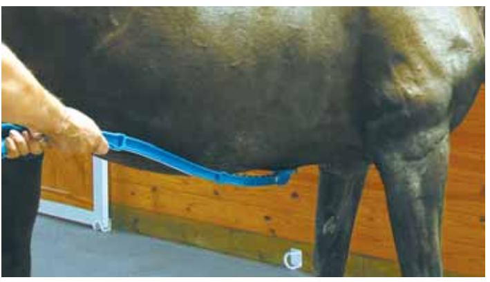
Made from fiberglass-impregnated plastic, Scratch Me Silly tool is designed so you don't have to bend over when scratching the animal.

Contact: FARM SHOW Followup, Scratch 'N All, P.O. Box 92, Dillsburg, Penn. 17019 (ph 888 972-7282; scratchnall@gmail.com; www.scratchnall.com).