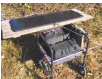
Wheelchair makes it easy to move solarpowered fencing system from field to field. It serves as a stand for the solar panel, car battery, and a photovoltaic controller that mounts on side of wheelchair.

Markley notes that the solar power works very well. The battery was only half charged when he hooked it up, but the solar panel has been keeping it fully charged. One change he may make is using a wheelchair with bigger wheels on the back that would be easier to