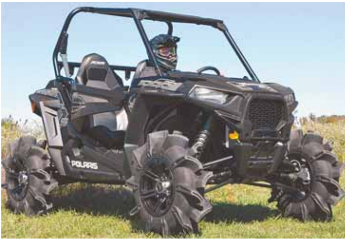
Assassinator Mud Tires come with 3-in. deep lugs that provide extreme grip in thick mud. The company says the tires ride smooth enough to be great for trail riding.