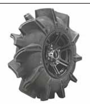
Mud Tires come in 28 to 40-in. sizes designed for 14, 20 and 22-in. wheel rims.

SuperATV, 2753 Michigan Road, Madison, Ind. 47250 or 1039 Kay Ln, Shreveport, La.