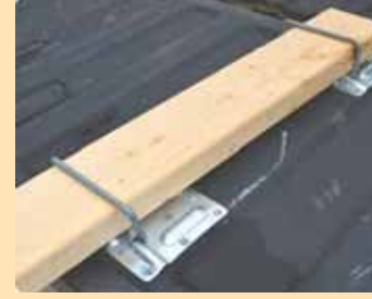
Boards slide into rectangular metal brackets.

The Tailgate Sawhorse is sold at Home Depot in the U.S. and at Home Hardware