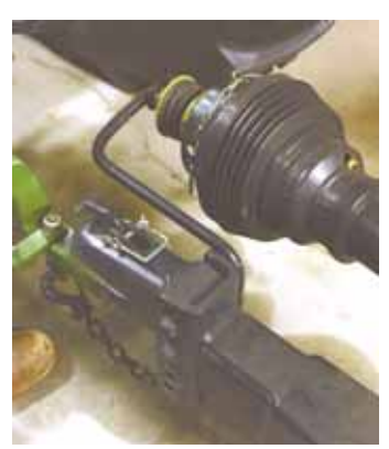
Rinke enclosed the wheel swivels and bearing spacers on his batwing mower with rubber pieces cut from shock absorbers, which keeps them clean (left). A swivel arm made of silo reinforcing rod mounts on mower hitch and holds the pto shaft when it's disconnected from tractor.