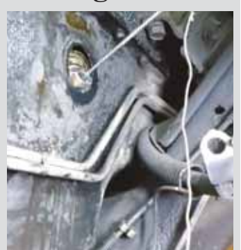
Heavy braided fishing line is tied to the end of a gun barrel cleaning brush, to keep the bulkhead from dropping into the oil pan.

"If the O-ring or parts of it stick, I use a dental pick to clean out the groove,"