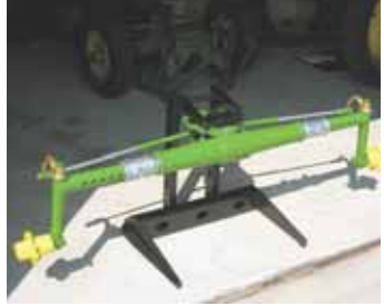
Front axle extensions for Deere "vegetable tractors" widen the front wheels to match the rear wheels.

Contact: FARM SHOW Followup, Dave Neil, 2920 Quaker Ave., New London, Iowa 52645 (ph 319 367-5690).