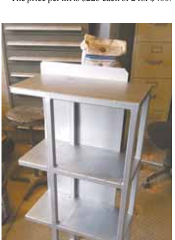
Chainsaws are stored on one side with oil and fuel cans on the other side. Chainsaw bars extend through gap at the back.

The price per kit is $225 each or 2 for $400.