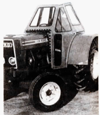
Nelson cabs fit most utility tractors ranging from Ford and Deere, to Yanmar and Kubota.

The cab features an electric windshield wiper, sliding windows, and an optional air purifier, air conditioner and heating unit. Cabs fit most utility tractors, ranging from the Ford and John Deere to the Yanmar and Kubota.