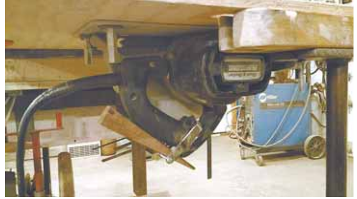
To keep the saw running continuously, he wrapped a metal bracket around the trigger and slipped a small wood wedge under it. To stop the saw, he just pulls out the wedge.