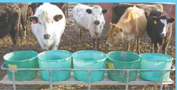
Jan Black used metal tubing and barn siding to make a platform for empty protein tubs, which are bolted on.

'The hopper measures 16 by 20. in. and was built by riveting pieces of sheet metal from an old washing machine. The hopper can hold almost a 5-gal. bucket of grain weighing 25