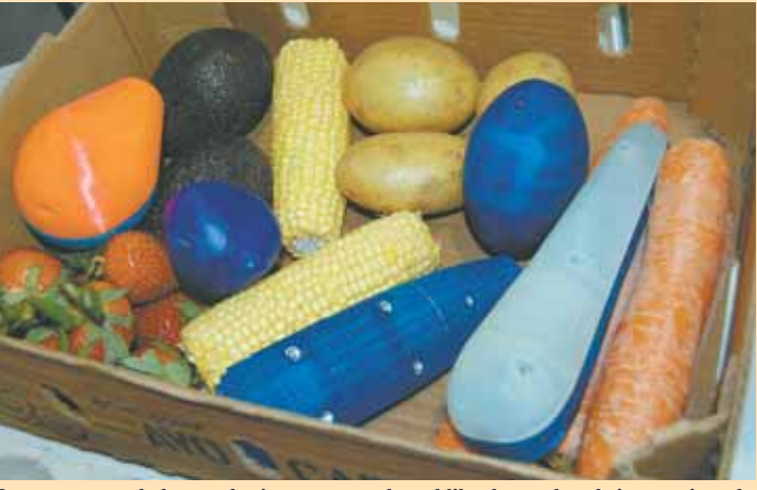
Battery-powered, data-gathering cases are shaped like the produce being monitored.

Powered by a lithium battery, the wireless mouse controller takes just minutes to install and lets the operator keep one hand on the wheel and one hand on the loader controls. (http://www.m-x.eu/en/default.aspx).