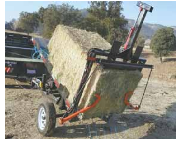
Hydraulicoperated blade on back slices down through bale to feed it out one flake at a time.

Contact: FARM SHOW Followup, Terry Atkins, 15430 Ave. 296, Visalia, Calif. 93292 (ph 559 733-0146 or cell ph 559 805-0335; rocknacattle@gmail.com).