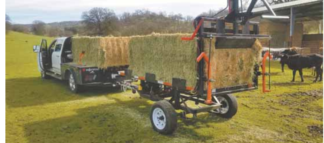
Flaker/feeder is designed to feed 3 by 3-ft. or 3 by 4-ft. big square bales. It comes with an electric winch that can be used to load the bale onto the trailer after the first bale has been fed out.

"It's a great way to flake and feed big square bales, because it saves on physical labor and associated costs and is trailermounted so it doesn't tie up a vehicle," says Atkins. "It'll flake and spread a big bale in less than 10 minutes. Also, there's no need to remove the strings."