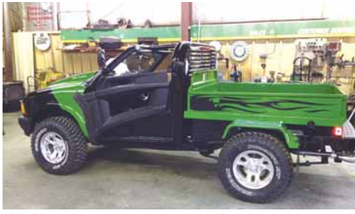
"Gazor" is a cross between a Chevy Blazer and Deere Gator. "It looks like an all-terrain vehicle equipped with a Gator box," says Monte Martin.