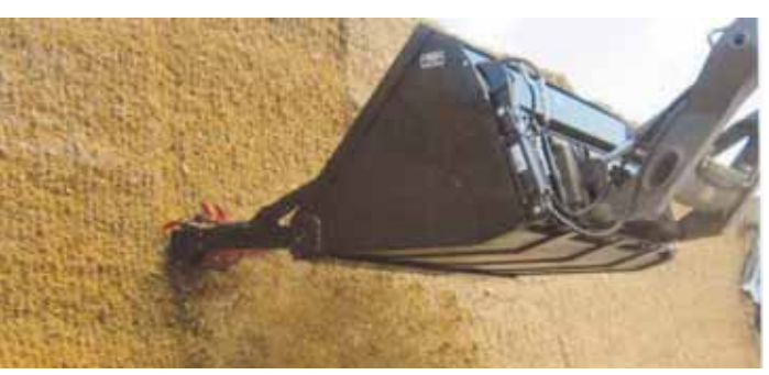
Hydraulic-operated rotating teeth on bucket fold out to tear silage off face of bunker silo.