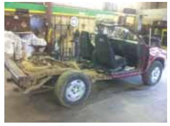
Martin cut off Blazer's body behind the bucket seats, keeping the frame and running gear.

Martin bought the Blazer with a caved-in roof and windshield for $300. He cut off the body just behind the bucket seats, keeping the frame and running gear. He then jacked up the roof to straighten out the windshield frame and installed a new windshield. He