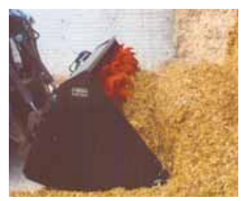
By folding teeth back in, operator can load bucket with loose silage.

about $6,500, depending on price of materials at the time of sale