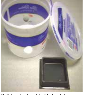
Bait tray is placed inside 1-gal. ice cream container with 4 evenly spaced holes cut into it.

Contact: FARM SHOW Followup, Thomas Votipka, 1632 Road 6700, Belvidere, Neb. 68315 (ph 402 768-7369; elissa42@outlook.com).