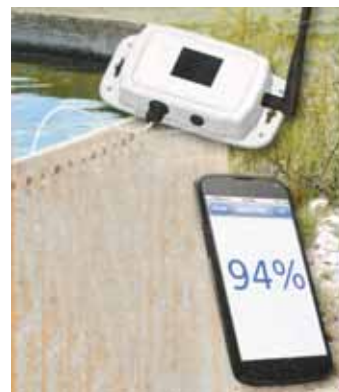
Solar-powered monitor lets you use your cellphone to check drinking water levels in livestock tanks.

Contact: FARM SHOW Followup, RanchCheck, P.O. Box 1743, Marfa, Texas 79843 (ph 469 480-0146; www.ranchcheck.com).