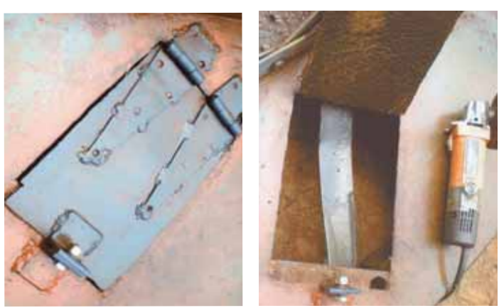
Fisher cut into the deck on his bush hog mower and installed an 8 by 12-in. hinged access door. "I remove a bolt and flip the door up, then use a grinder to sharpen the blades," he says.