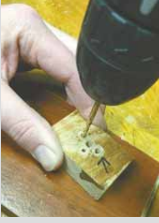
Ryan Van Der Bill, Sioux Falls, S. Dak.: "One idea is that when you need to drill a straight hole and you don't trust your eye with a hand drill, take a small block of oak or maple and drill a hole through it with a drill press. Then use that block as a guide when using a hand drill."

"On older vehicles, I often replace the plug in the bottom of fuel tanks with a 2 to 3-in. nipple and petcock. This serves as a 'dirt leg', allows me to easily drain off old gas, check for water in the gas, and provides an emergency supply of gas that I can easily access with a short hose. I put a cap over the petcock just to be safe.