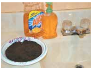
A mixture of dish soap and coffee grounds works well for removing grease, says Andrew Gallagher.