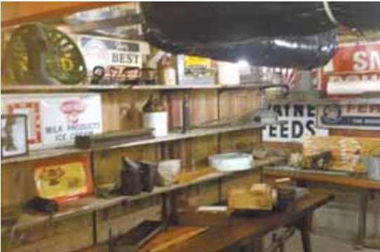
Ed Larson collects rare antique dairy memorabilia and has several brands of antique milking machines that feature pulsating action (above). His collection also includes glass milk bottles, butter churns, dairy signs, and more.