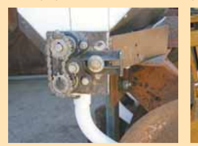
Photo at left shows secondary drive to metering shaft. Photo at right shows metering tube attached to bottom of hopper.