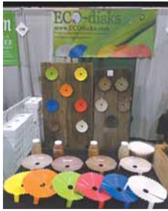
Biodegradable ECO-disk blocks weeds from growing and has ridges that collect water and channel it to base of plant.

non-GMO_BPH-free and U.S -made at an injection mold plant in Holland, Mich. With about an 1/8-in. thickness they are a heavy and durable biopolymer. ECO-disks sell for $47.95 for 12 disks through the business's