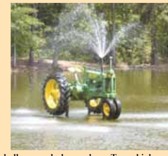
A pair of tractor fountains, parked in a shallow pond along a busy Texas highway, entertains visitors to Ffurd Orchards