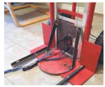
Two pieces of angle iron on base keep 2-wheeler from tipping forward when lifting a load.