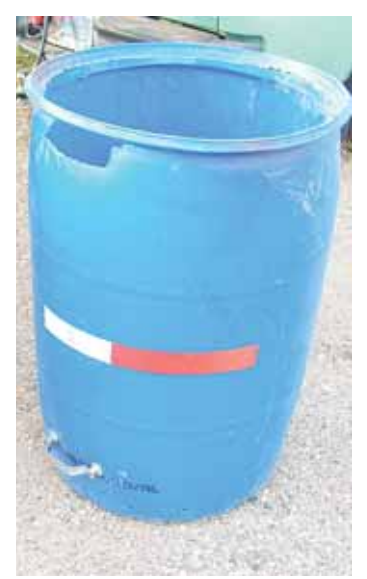
Gary Swensen converts old plastic 55-gal. barrels into garbage cans that are lightweight and won't rust.

Contact: FARM SHOW Followup, Gary Swensen, 1408 Sunrise Drive, Yankton, S. Dak. 57078 (ph 605 660-3489; g_swensen@ msn.com).