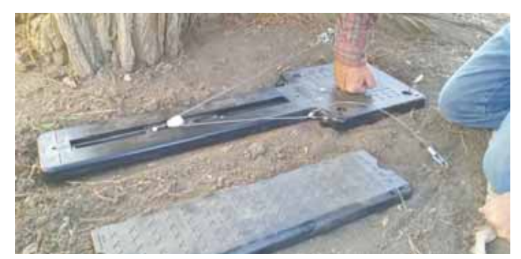
Snares are animal specific with a humane design. Animals trapped for relocation can be held without injury by one of 8 different snares.