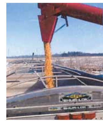
Spring-loaded spout can be adjusted forward or backward by cranking a hand-operated winch at bottom of auger.

"Conventional spouts splatter the grain in an 18-in. wide pattern whereas the Target Spout confines the grain to a narrow 4-in. wide area. And unlike with conventional auger spouts, you can aim the spout wherever it needs to be. As a result, it doesn't matter if the spout isn't located directly over the center