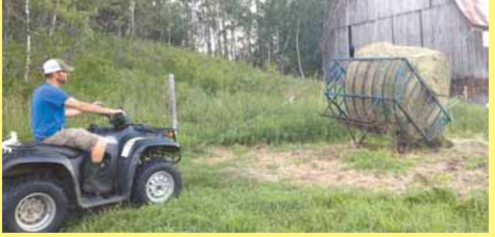
Challen shoves a steel rod through center of bale to create an axle. Cables that run from ends of rod to his ATV let him roll bale into feeder turned on its side. Feeder and bale are then pulled upright.