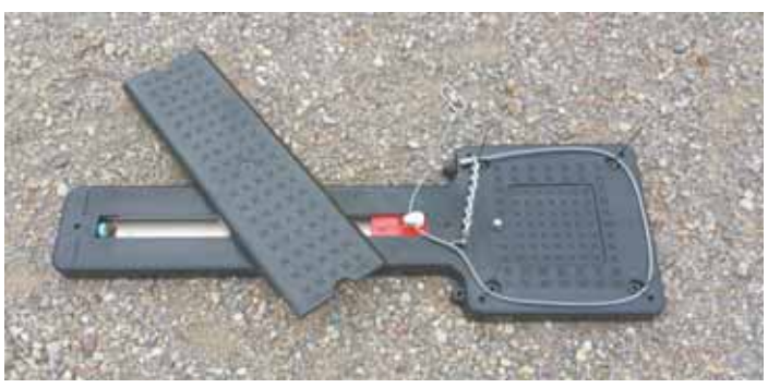
Select-A-Catch foot snare can be set for the weight of the animal to be caught. A 12-in. square tension pad with a 6-in. square trigger at the center activates the snare.