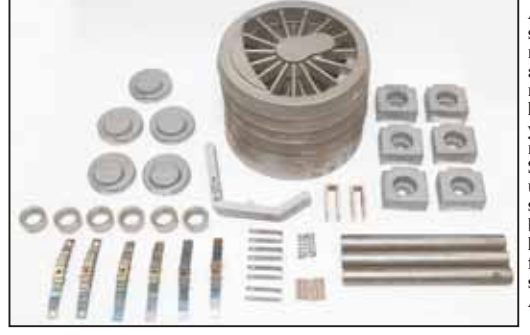
Allen Models specializes in making kits for authentic 1/8-scale model steam locomotives that you can sit on and ride. Kits start at $3,200 and run up to $5,800. "We supply the castings, but there's a lot you have to fabricate yourself," says Steve Alley, Allen Models.