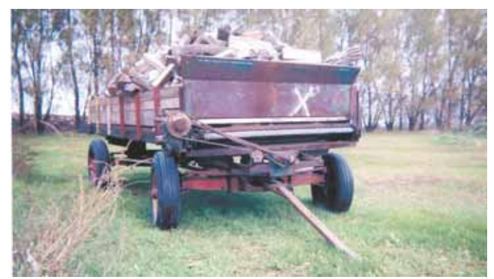
Roger Reibsamen built this self-unloading trailer out of a chopped-down silage wagon. It unloads out the back using the original apron chain.

Contact: FARM SHOW Followup, Roger Reibsamen, 123 Ingham St. N.W., Titanka, Iowa 50480 (ph 515 928-7006).