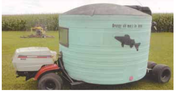
A 1,000-gal. poly water tank bolts to the extended undercarriage of an old lawn mower.

Contact: FARM SHOW Followup, Virgil Davis, 2686 250th St., Humboldt, Iowa 50548.