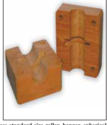
Woodex Bearing Co. in Maine still produces standard-size roller, hanger, spherical and custom wood bearings. Some modern farm equipment still uses wood bearings.

says Steuernagle. The company began in 1905 as a trademark of the Neveroil Bearing Company, which produced bearings for New England's textile industry. As those businesses moved south, or overseas, Woodex moved north to Maine, where today the employee-owned company thrives. "Our