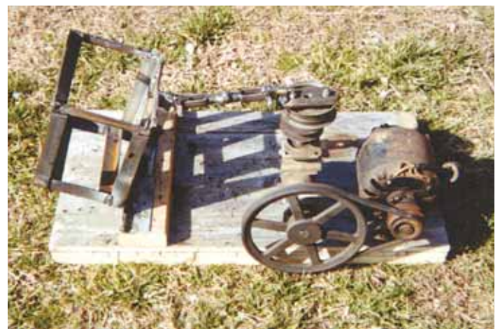
Automatic paint can shaker uses a 1/3 hp electric motor to belt-drive a right angle gearbox that reduces the speed.

"When I'm done, I roll up the hose by hand – mostly because I need the exercise. It would be easy to add an electric motor and chain to drive the gear that's still in place on one side. The entire reel mounts on a hand cart so it's easy to move around."