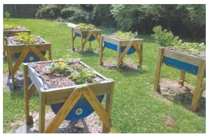
Raised garden beds are made out of treated lumber and 55-gal. plastic barrels. "We like not having to bend over to plant or pick vegetables," says inventor Terry Benoit.

Contact: FARM SHOW Followup: Ken Hovet, Browerville, Minn. 56438 (ph 320 491-8928; hovet@wisper-wireless.com).