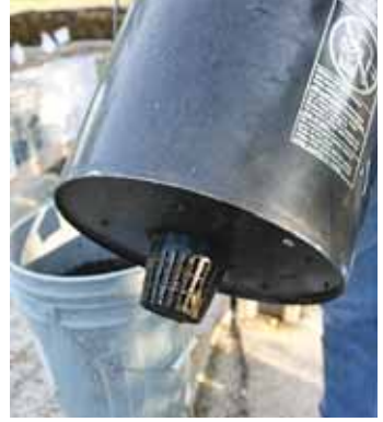
Plastic net filter cup is inserted into hole cut into bottom of each bucket, to draw water out of rain gutters

The entire system is reusable year after year. Hovet says, "We're into our fifth