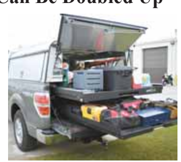
"SlideZilla" sliding tool trays can be stacked 2-high, with one between the wheel wells and one above.

and tie-downs for securing the trays and stored items. They are available from dealers online and off. Dealer 4wheelonline.com offers frames for the Elevated Sliding Trays from $339.95 to $354.95. Elevated Sliding Trays to fit the frames are priced from $419.95 to $649.95. Lower trays, which come completely assembled, are priced from $819.95 to $849.95.