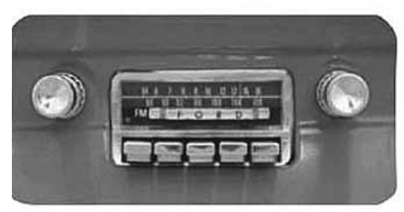
Vintage look radios for antique cars and pickups come with modern electronic technology.

Contact: FARM SHOW Followup, Vintage Car Radio.com, 51041 County Road 11, Elkhart, Ind. 46514 (ph 877 331-9560; www.vintagecarradio.com).