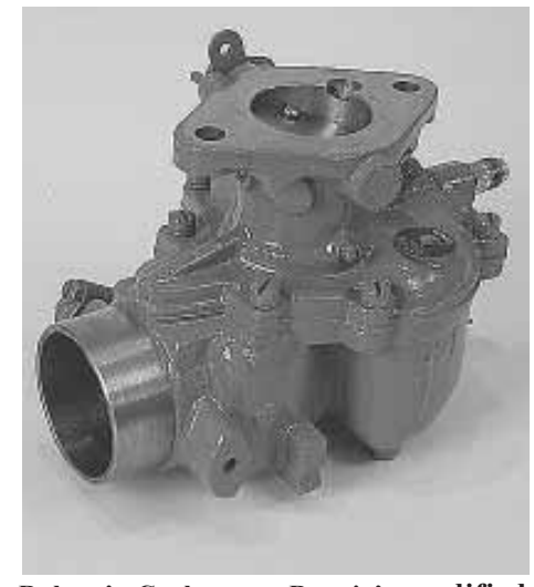
Robert's Carburetor Repair's modified Zenith carburetor cleans up the black smoke and fouled spark plugs common to Deere 3010/3020 and 4010/4020 tractors.