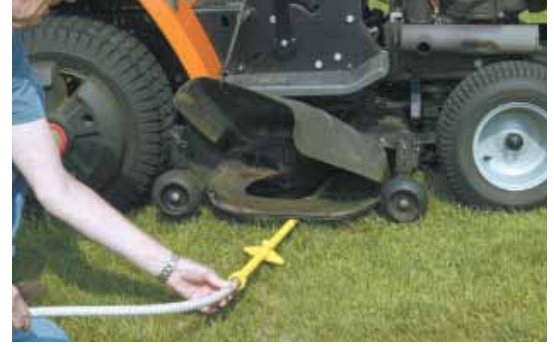
To clean the deck, you connect the washer to a garden hose and slide it all the way under the deck. Then you turn on the water and also turn on the mower.

The Empire riding mower deck washer is made of high quality, durable ABS material that won't warp, crack or deteriorate and comes with operating instructions and a 100% money back performance guarantee. Price is $19.50 plus $8.50 shipping.