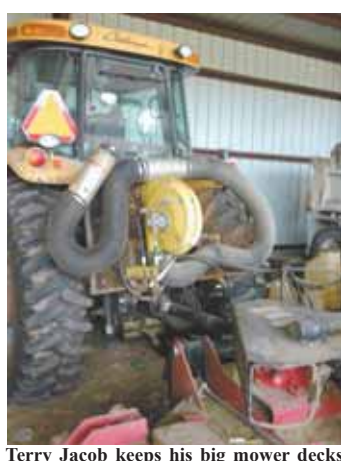
clean with this hydraulic-operated fan and 6-in. hose mounted on back of his tractor.

Jacob estimates the fan puts out the equivalent of an 80 to 90 mph wind. The entire apparatus attaches and detaches with only 2 bolts, whether the screen is in the upright or lowered position. He suggests