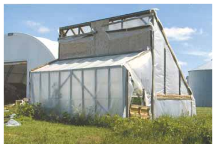
Hydroponic 12 by 20-ft. greenhouse is covered with heavy plastic. Sloping south roof maximizes sun warmth.

Contact: FARM SHOW Followup, James Martin, 13580 E. Sargent Rd., Lodi, Calif. 95240 (ph 209 333-2359).