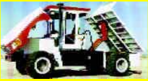
Designed and built by a Kansas farmer, the "Ranch Hand" has a one-seat, full-vision cab and a rear dump, 8-ft, sq. flatbed. The cab also has a tilt hood with gas shock assist. It'll go from 4 mph to 48 mph. Powered by a 165 hp 5.9-liter Cummins turbocharged diesel engine, it can pull anything a 140 hp tractor can pull, such as a 22 to 24-ft. field cultivator or 20-ft. disk. The flatbed can carry an 8,000-lb. load.