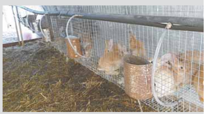
Automatic cage watering system provides water for 8 rabbit cages at once. A 5-gal. bucket at back sits above cages on a stand and serves as the water reservoir.

Contact: Farm Show Followup, Caleb Howerton, 1603 N. Delaware Ave., Springfield, Mo. 65803.