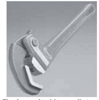
There's no need to tighten an adjustment nut with this self-adjusting pipe wrench.

You can purchase it wherever Ridgid tools are sold, or order it on line at toolup.com or grainger.com. The online price is under $25,