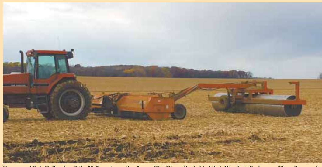
George and Dale Hallcock pull the 20-ft. center section from a Rite-Way roller behind their Woods stalk chopper. The roller smashes and flattens sharp stubble, and creates a smooth surface for fall tillage.

Dale Hallcock says when he drives diagonally across the rolled stalks pulling the disk the field is as smooth as a road. The level surface allows the disk to penetrate at an even depth and thoroughly blend residue with the soil. When they plant corn on corn, there's less surface residue for the young corn plants to contend with.