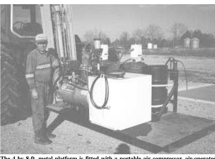
The 4 by 8-ft. metal platform is fitted with a portable air compressor, air-operated grease gun, 50-gal. fuel tank, and three 120-lb. grease drums.

Contact: FARM SHOW Followup, Dwight Colson, 860 Spruill Rd., Caledonia, Miss. 39740 (ph and fax 662 356-6631).