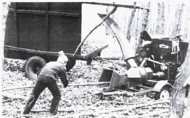
The Wood Hogger can chew up a log 8 ft. long and 6 in. in diameter in about 3 seconds, according to Mauno Silpala, the machine's importer.