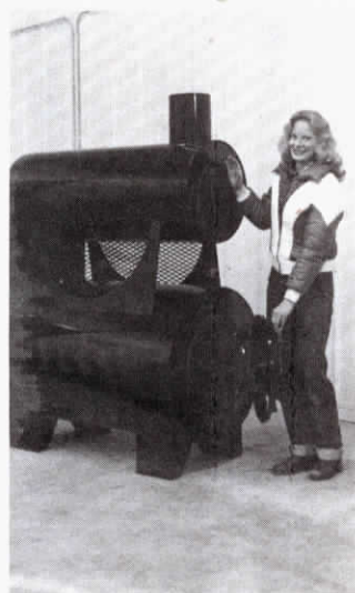
The stoves double-walled barrels act as heat exchangers, extracting the maximum amount of heat from the fire.

The large firebox will hold round logs big enough to hold heat for 10 hours without firing. Besides burning standard fire wood, the Pribbs stove will handle railroad ties, scrap wood, and cardboard. Some wood industries are heating their plants en-