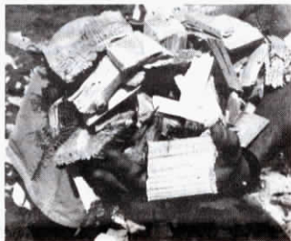
The chips are 2 to 3 in. long and 1 to 1½ in. thick.

The "Wood Hogger" handles logs up to a maximum of 6 in. in dia. For demonstration purposes, Silpala often feeds 4 by 4's or fenceposts into the machine to demonstrate its capabilities. It'll chop up a log 8 ft. long and 6 in. in dia. in about 3 seconds. The machine has a large conical screw with a hard-surfaced blade that can't work loose and needs no adjustment, says Silpala. The blade must be sharpened regularly but is designed to be sharpened with a hand-held grinder without having to