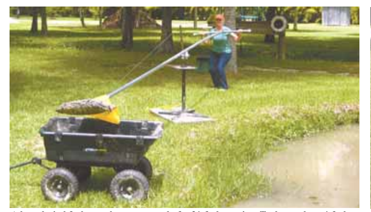
A broad pitchfork attaches to one end of a 21-ft. long pipe. Taylor grabs a 4-ft. long Pipe rides on a small metal roller mounted on a pedestal base. T-handle to push or pull the pipe, and also to rotate it from side to side.

Contact: FARM SHOW Followup, Jody Taylor, Taylortec, Inc., 16152 E. Club Deluxe Rd., Hammond, La. 70403 (ph 985 542-6266; sales@taylortec.com)