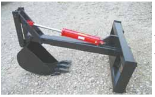
Quick-tach backhoe attachment uses a 12-in. bucket that digs down to 6 ft.

Contact: FARM SHOW Followup, Linus Huerter, HSB Welding & Fabrication, 1565 120th Rd., Seneca, Kan. (ph 785 336-1562; 785 336-3173).