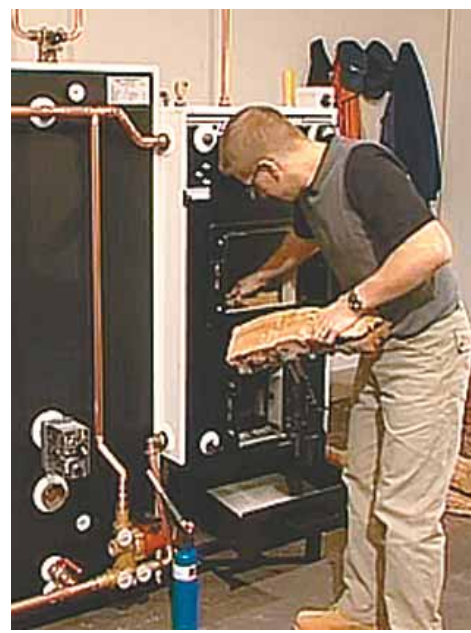
Imported "smokeless" wood boilers use the energy available in wood twice as effectively when compared to traditional wood boilers, say manufacturers.

"Varmebaronen boilers are very efficient and reliable," Zook says. "Any high wear combustion tunnel parts are made to be