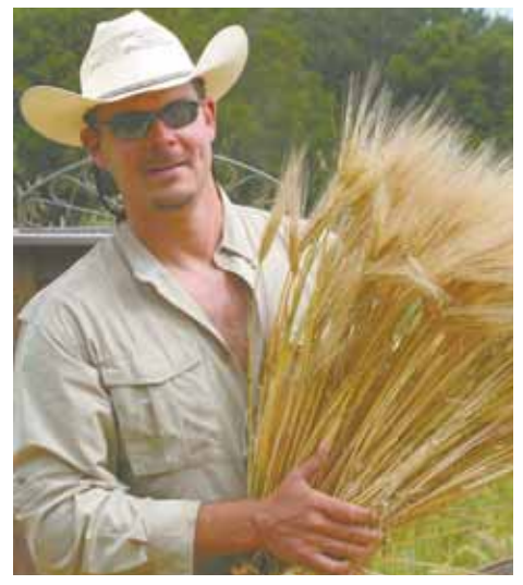
Sustainable Seeds Co. offers more than 300 varieties of heritage grain lines, from sesame seed to amaranth to wheat.

Contact: FARM SHOW Followup, Sustainable Seed Co., P.O. Box 38, Covelo, Calif. 95428 (ph 707 703-1242; toll free 877 620-7333; support@sustainableseedco.com; www.sustainableseedco.com).