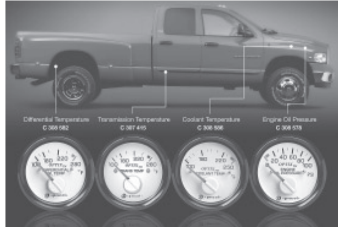
Getting a better read on key temperatures and pressures is the goal of Danin's new diesel performance gauges.

Contact: FARM SHOW Followup, Danin, Inc., 3944 W. Segerstrom Ave., Santa Ana, Calif. 92704 (ph 714 662-060); toll free 800 398-6580; fax 714 662 0607; www.danininc.com).