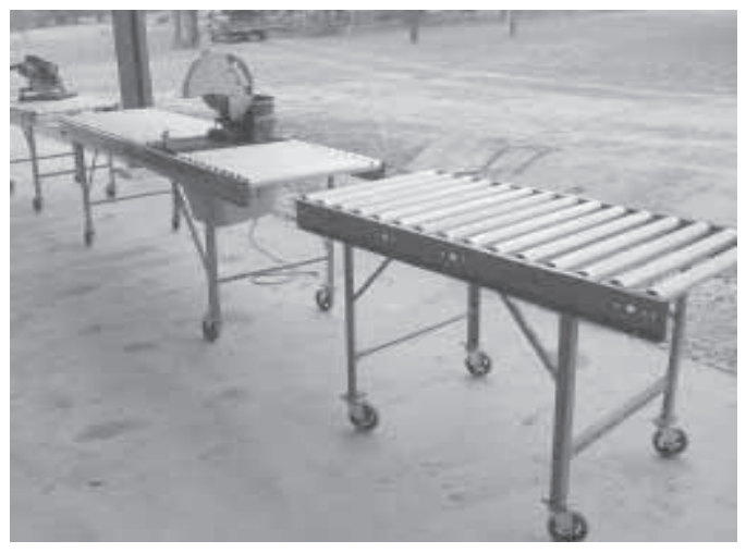
Saw sits in middle of one 10-ft. roller section. The other roller section was cut in half to provide two 5-ft. sections.

"It's one of the handiest things I've ever done for my shop," says Mallett. "The caster wheels let me roll the cutting table anywhere I want and also serve as an additional table surface for other projects when needed. I set the conveyor rollers at a 35 1/2-in, height to match the height of my welding table. That way if I want to extend a piece of what I'm cutting over to the welding table, everything will be at the same working height."