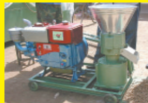
"Owner's Report" On Pellet Mill (Page 15)