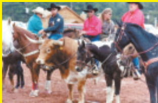
Steer-Riding Catches On (Page 24)