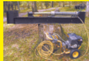
Water-Powered Log Splitter (Page 28)