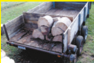
Simple Rear-Unload Trailer (Page 4)