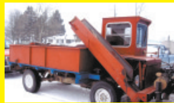
Self-Propelled Wood Splitter (Page 4)