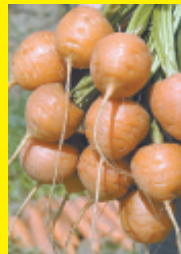
Eye-Catching New Garden Varieties (Page 26)