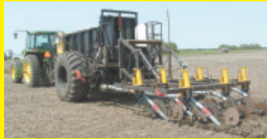
Solid Manure Injection System (Page 2)

To Subscribe, Call 1-800-834-9665 (Or Use Order Form On Page 44)