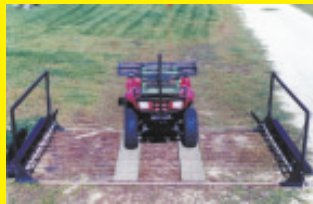
"Floating" Electric Cattle Guard (Page 20)