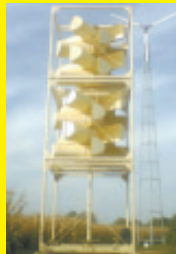
Wisconsin Man Designs New Windmill (Page 43)