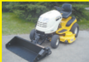
Electric-Powered Loader For Small Tractors (Page 27)