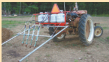
Home-Built Flamer Burns Up Weeds (Page 17)

To Subscribe, Call 1-800-834-9665 (Or Use Order Form On Page 44)