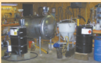
New Method Cuts Biodiesel Cost (Page 42)