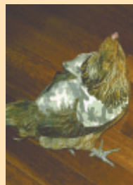
“Aprons” Protect Birds From Pecking, Predators (Page 3)