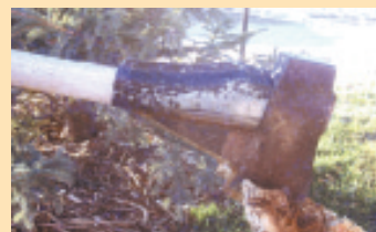
Axe Handle “Saver” (Page 20)