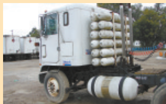
Trucks Converted To Natural Gas (Page 10)