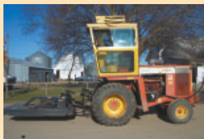
Forage Chopper Shreds Brush (Page 19)

To Subscribe, Call 1-800-834-9665 (Or Use Order Form On Page 44)