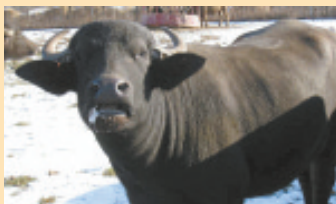
Water Buffalo In Big Demand (Page 6)