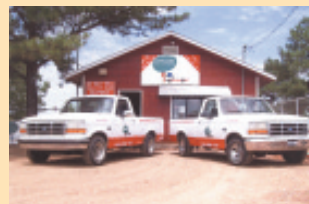
Repowered Pickups Get 40 Mpg (Page 3)