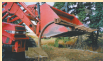
“Made It Myself” Potato Digger (Page 25)