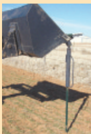
Bucket Post Driver Fits Front-End Loader (Page 11)