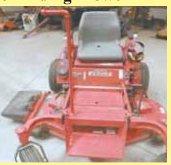
Pipe "assist handle" bolts onto deck of zero-turn mower.

Contact: FARM SHOW Followup, Kenneth Preston, 961 S. Enley Rd., Wheatland, Ind. (klpres@yahoo.com).