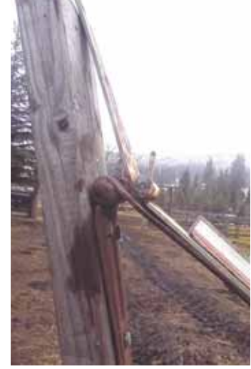
Hinges bolt together on 2 by 4 to provide leverage against wood posts.

DeWit jams the 2 by 4 into the ground at an angle against the post, with the jack handle back. Pushing the handle up causes the free end of the hinge to force the post upward a couple inches. As the post moves out, the 2