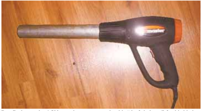
Dan Dodge used a 1,500-watt heat gun to make this "draft inducer" for his kitchen stove, adding a 10-in. length of thin-wall conduit to the end of the gun.