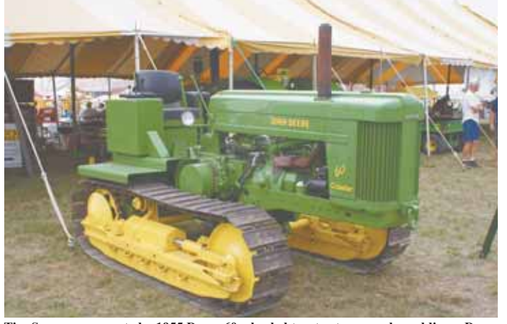
Tim Sweeney converted a 1955 Deere 60 wheeled tractor to a crawler, adding a Deere 2010 track and steering clutch assembly.