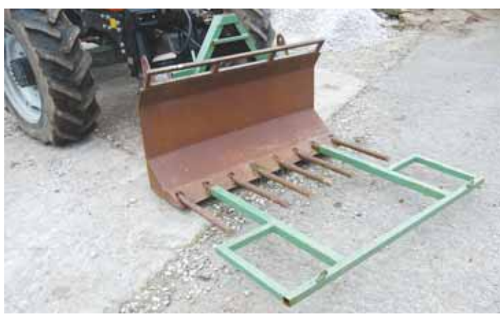
Alistair Robert used 2-in. box tubing to build this loader-mounted ATV hauler. The frame slips over 2 forks on loader bucket.

Contact: FARM SHOW Followup, Dan Dodge, 630 Dodge Rd., Camano Island, Wash. 98282 (ph 360 387-0727).