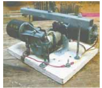
Salvaged power window motors drive mini-winch, which is equipped with a 3-in. long spool and high-strength webbing.

Contact: FARM SHOW Followup, Ronald Krentz, 9108 S. Timberline Terrace, Inverness, Fla. 34452 (ph 352 341-0612).