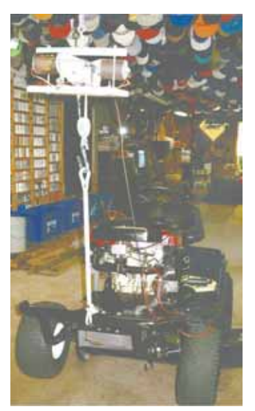
Krentz uses the mini-winch to lift spare tires into place, and to lift his riding mower for blade replacement.