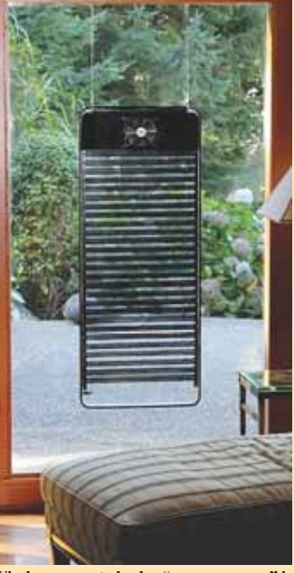
Window-mounted solar "room warmer" is fitted with a solar-powered fan that moves heated air into the room.

"We're reducing the natural gas used to heat a greenhouse. We can save a 100,000 sq. ft. greenhouse up to $140,000 per year compared to using natural gas," says Mackay.