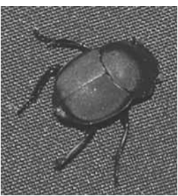
Sandra Marvel says there's a significant market for dung beetles, which she sells to fellow ranchers, zoos, pet owners and even graduate students, who buy them for research.

"I fill it in the fall, and as the leaves compost, they provide heat. When it gets too cold, the leaves stop composting, but they