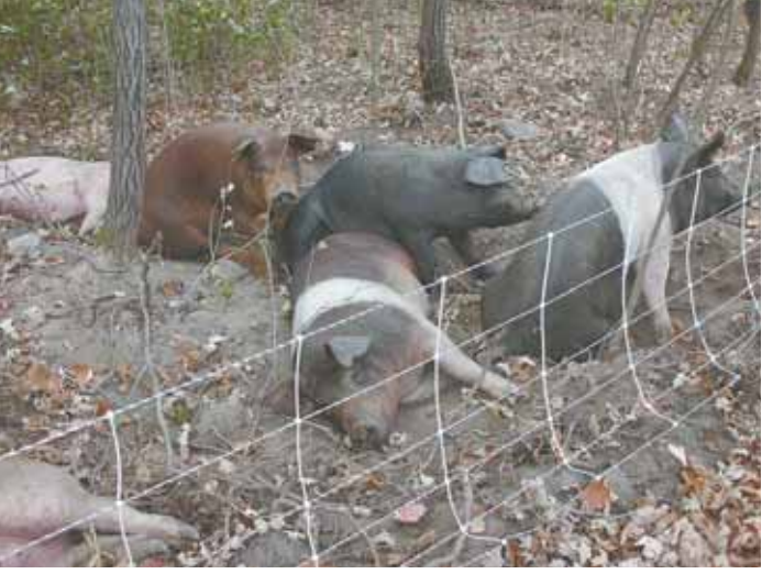
Nancy Lunzer used hogs to reclaim a woodlot that had been overtaken by buckthorn.

Generally, grazing woods is not recommended, she notes. But the buckthorn infested areas were useless. Now sugar maple and basswood seedlings are growing to