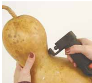
Gourd tool kit comes with tools specially designed to make artistic designs. Kit includes a gourd saw, drill, sander, saw blades, engraving cutters and sanding sponges.

sells several books on specific types of gourd art from "Gourd Musical Instruments" to "Gourds and Fiber."