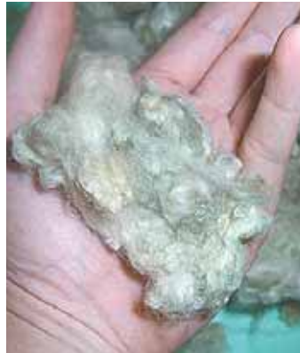
Southern Exposure Seed Exchange sells seed to grow naturally colored cotton. Colors range from shades of green and tan to golden brown.

than other browns, grows 5 to 6 ft. tall and has "naked seeds" that separate from the lint easily.