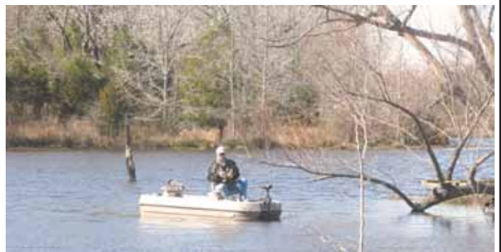
Texas-based fishing club leases ponds and then rents them to club members by the day or half day. Landowners benefit from lease payments and fishing water management assistance.

Contact: FARM SHOW Followup, Southern Exposure Seed Exchange, P.O. Box 460, Mineral, Va. 23117 (ph 540-894-9480; gardens@southernexposure.com ; www.southernexposure.com ).