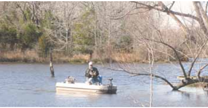
Texas-based fishing club leases ponds and then rents them to club members by the day or half day. Landowners benefit from lease payments and fishing water manage-

Contact: FARM SHOW Followup, Southern Exposure Seed Exchange, P.O. Box 460, Mineral, Va. 23117 (ph 540-894-9480; gardens@southernexposure.com; www. southernexposure.com).